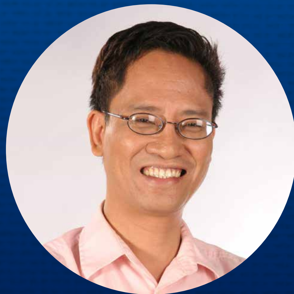
Danton Remoto Acclaimed novelist, poet, columnist, academic and activist